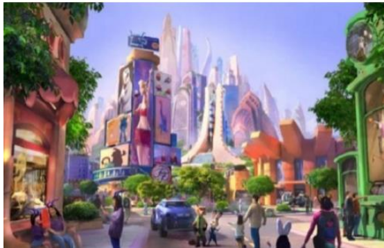
Figure 7. Downtown City in the Savana Central district film Zootopia

center. Although there are many different architectural shapes, the proportion of skyscrapers, both those that are and those that are not, is what unites them. This district can be distinguished by its vegetation. On the left and right sides of the district's landscape, there are hints of greenery. The vegetative components in the composition to the left and right are vertically oriented, as if to balance the foreground and backdrop. In contrast to the towers behind it, the greenery feature in the centre creates a horizontal direction. In terms of composition and depiction of reality, vegetation is an aspect that contrasts with skyscrapers. Skyscrapers are present, and the idea of a large metropolis devoid of vegetation is the same. Yet, it is offered in this instance so that the goal of balance can be met. The tentative conclusion is that this image of the contrast between realistic and non-realistic conditions serves as an iconic representation of the idea of paradise.