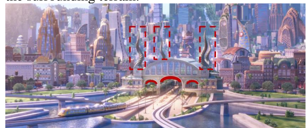
Figure 2. Symbolic visual creativity of Savana Central - Downtown city as the embodiment of utopian

The ecosystem region of Savanna Central features circumstances that are most similar to those seen in the actual urban environment found in the human world. The government building and other urban utilities are situated in this area, which is a megacity. The markers of the downtown city area are shown in figure 2 with a facade that resembles a gate or gate, which is frequently a marker of a border between one area and another. Three segmental shapes make up the image of the main city gate, which has a centered arrangement. A segmental shape with a large dimension sits in the center, and two smaller segmental shapes on either side. Four features that resemble a horn and have four sharp edges, a curved shape, a textured surface, and an upward-pointing orientation serve to amplify the building's impression (vertical). The gate's image is built not only using a separate image from the buildings behind it, but also using its position in the middle and the area that serves as the foreground of the image. It's fascinating to note how the presence of water, a natural element, seems to dominate this scene and harmonize it with the surrounding terrain.