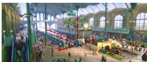
Figure 3. Visual creativity of Zootopia Express Station in Savana Central district

circulation that is its primary activity. Figure 3 shows how it appears to be converging when viewed from the length of the room. The common supply of elements and spatial arrangement are aided by composition that is space-centered. The arrangement of the people and the space is directly impacted by this. The zootopia express line is shown in figure 3 as a feature that divides the area between this zootopia express station. The path's position in front of the plant life emphasizes its position as the space's focal point. A vertical palm species makes up the planted vegetation. The juxtaposition of a vertical (palm) and horizontal (zootopia express line in front of the palm tree and plant path behind the palm tree) composition becomes the focus of attention and an illustrative representation of the paradise that the movie is trying to sell.