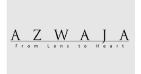
Figure 1. logo of micro, small and medium enterprises azwaja photo

Azwaja Photo is an business enterprises in the field of photography, more specifically engaged in wedding photography, which has been established since 2017. To increase its marketing, so that it can be better known by the wider community, researchers are trying to design an information website related to Azwaja Photo. the following is the logo of business enterprises azwaja photo as in the figure 1 :