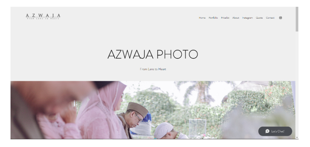
Figure 6. Home Page Section

Figure 5 shows the admin page display on the main page using the wix.com application, it can be seen that the features provided by the wix.com application are very easy to use. So that wireframe implementation, design mockups can be easily designed using wix.com. In addition, the results displayed are also by the designed concept. The following is a picture of the main page through Figure 6: