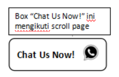
Figure 4. Chat Box

In addition, to make it easier for users to interact with admins or website operators, researchers display a live chat feature which is placed in the lower right corner, so that users can interact, communicate, and ask questions through this feature that has been displayed on all pages on the designed website. as in the figure 4 :