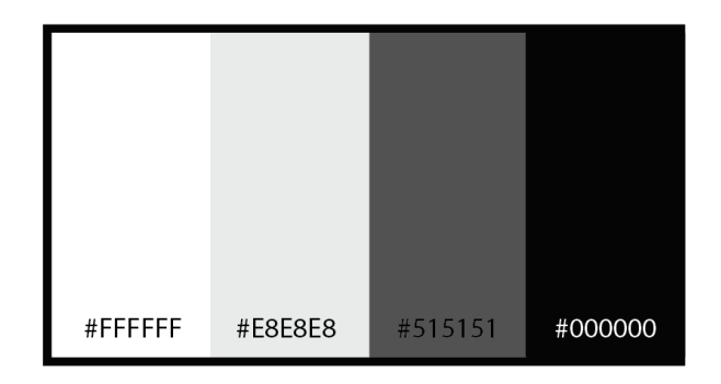
Figure 2. Colour Palettes

The minimalist color concept was chosen in the application of this website design because to get an elegant impression, with the application of simple, warm colors, and build emotion and expression of a minimalist style. [8] For this reason, researchers chose black to build the impression of strength, sophistication, sexuality, white to build the impression of purity, cleanliness, trust and used a combination of black and white colors, namely gray which gave the impression of natural, intelligence, and the future. [9] as in the figure 2.