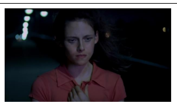
Figure 12. Flashback 'Melinda was walking home alone' 01.09.15