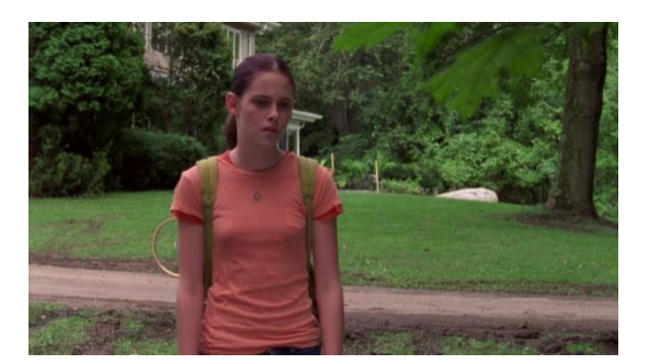
Figure 13. Discourse time 'Melinda was standing musing herself in the venue' 01.14.38