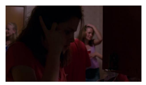
Figure 4. Flashback 'Melinda Panic and call the police', 00.09.11