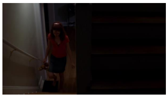
Figure 10. Flashback 'Melinda up stairs to her parents' room' 00.50.46