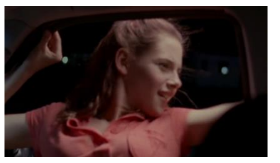
Figure 2. Flashback 'Melinda with her friends in the car', 00.06.44