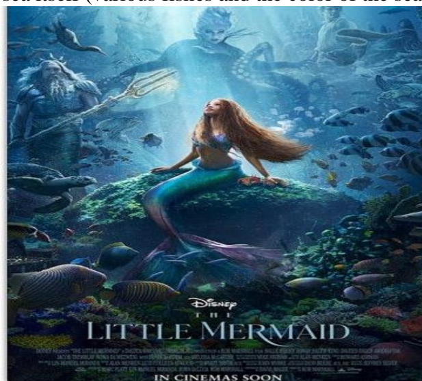
Figure 1. The Little Mermaid Movie Poster

In this study, the author uses movie poster as a media which will be analyzed using the semiotic theory put forward by Charles Sanders Peirce, and uses The Little Mermaid movie poster as the only object of this research. Figure 2 shows the movie poster of the Little Mermaid. In the movie poster, we could see words and images which can be classified as a sign. All these signs held meanings. From the picture, we can see that there are three (3) verbal signs and one (1) non-verbal sign as a unit, which consists of the visualization of the mermaid, the prince, the villain, the King of the sea, as well as the visualization of the sea itself (various fishes and the color of the sea).