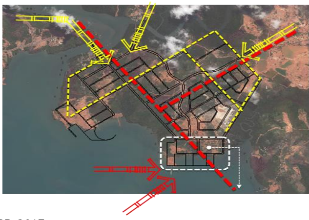
Figure 3. Tanjung Moco Port Location