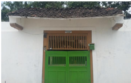
Fig. 2. "Reading" the Gate of the Kidang Mas Peranakan House: Simple, has Chinese Cultural Influence, seen from the roof of the gate, the front gate is called Hek, a name known during the Dutch Colonial Period.