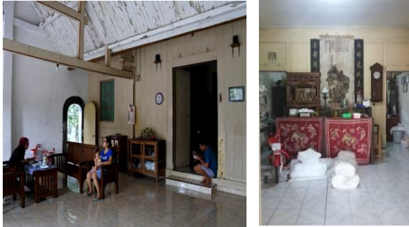
Fig. 1. "Reading" the house of Peranakan Kidang Mas: The House has a Chinese cultural influence, however, the floor material has changed to use contemporary materials.