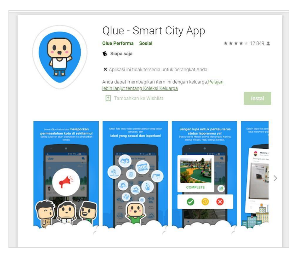
Fig. 1. The front page of the Qlue application

information Current technology policies innovation through government and information technology programs can be seen from several aspects: regulations or policies related to ICT management, Information Network Infrastructure policies, Information Management, Community, and Human Resources. These aspects must managed. The implementation of e-Government can lead to good orderly egovernment so that the services provided through the government website are supported by effective management of systems and work processes due to the readiness of regulations, procedures, and adequate human resources to encourage of information and communication technology. In public service. The following is an example of an e-government application website in Indonesia, as shown in Figure 1 below.