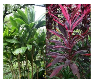
Figure 2. Hanjuang plant

Hanjuang is one of the plants that grows a lot in the land area of Sunda, West Java. Apart from functioning as a protective plant and barrier in rice fields or fields, Hanjuang plants are also often planted as a barrier or fence in the yard. For the people of West Java, Hanjuang is a plant that is considered special, not only considered as an ornamental and medicinal plant, but also as a guardrail against various disturbances from supernatural powers and disease outbreaks (Sunarni, 2016).