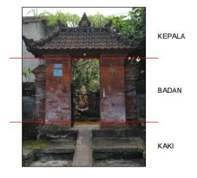
Figure 2 Tri Angga on Angkul-Angkul

Tri angga is a concept that divides the three physical lives by hierarchy. Tri angga is implemented into the life of the Balinese people in every physical form of architecture, territorial, region and region. Based on the value system, the concept of Tri Ais not divided into three parts, namely; The main Angga is the part that is in the main or highest position (head); Madya Angga is the part that is in the middle place (body); Nista Angga is the part that is in the low or lowest position (foot).