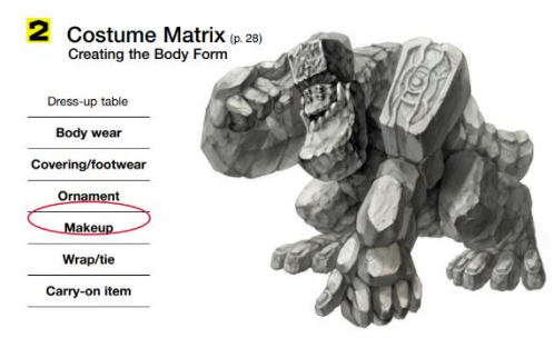
(Makeup) Sculpture Figure 1 Costume Matrix

designing a character. (Tenma, 2020). In costume matrix (see Figure 1), when the character base has been designed in such a way using a form matrix, the next step is the use of costumes. The character designs that are formed and demonstrated can later use props as if they were using certain objects. Typical costumes from this matrix are clothing, motifs, props such as weapons, attributes, and so on. For the Costume Matrix, Tsukamoto provides parameters to facilitate the creation; the parameters listed are as follows; Bodywear, covering/footwear, ornaments, makeup, wrap/tie, and carry-on items. (Tsukamoto, 2008)