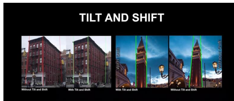
Figure 4. Distorted Photo Perspective