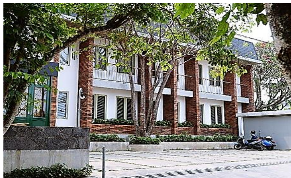
Figure 8. Exterior of The House Tour Hotel

The House Tour Hotel is located on Jl. Panumbang Jaya No.5 Bandung, located in a very strategic area that is in the Ciumbuleuit area. The area is within close proximity of attractions such as Rabbit Town, Cihampelas Walk and Punclut. To get to The House Tour Hotel can use private vehicles and public transportation such as: angkot, taxis, and other vehicles based online. The House Tour Hotel is one of the hotels of Maja Group, a company engaged in hospitality, restaurant and function hall. According to Maja Group's website, The House Tour Hotel carries the concept of new urban with a little touch of bohemian nature and tropical style, which gives the impression of a warm atmosphere and in harmony with the cool climate of Bandung. The purpose of the concept of new urban means a form of design that can promote environmentally friendly habits and blend with nature, with the concept of new urban is expected to provide correctness and comfort for every visitor to the hotel. For the exterior and interior façade of The House Tour Hotel is dominated by such colors; white, green, brown and orange, other colors also appear from the exposé colors of natural materials such as: brick and wood. According to hicoates site the color brings a sense of comfort in the room and gives a warm impression (Hicoates, 2020).