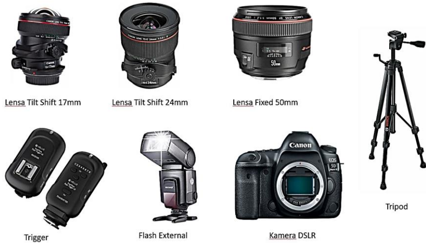
Figure 2. Photography Equipment

these equipments plays an important role in every interior space shooting process. Moreover, if supported by premium quality equipment, it will be easier to produce photos that are sharper, brighter and have professional quality.