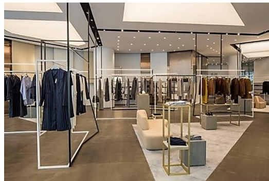
Figure 6. Photograph of Interior in Detail

According to M (2016), when shooting commercial spaces, it is important to capture all the interior elements to capture the attention of customers. Like fine details, the clear texture or contrast of the furniture is the part that determines the atmosphere of the room. Therefore, when shooting interior it is recommended to use higher apertures (such as f/8 – f/22 ), a low ISO and longer exposure to ensure each element looks sharp in the image.