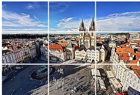
Figure 9. Rules of Third

According to Fajri, et al (2017), rule of third is one of the famous ways or tricks in the world of photography, this way is used to produce beautiful photos. In rule of third, the viewfinder and camera screen will be divided into 3 per 3 columns of the entire screen resulting in 9 columns in the screen, there are 4 midpoints that go through vertical and horizontal lines as (point of interest).