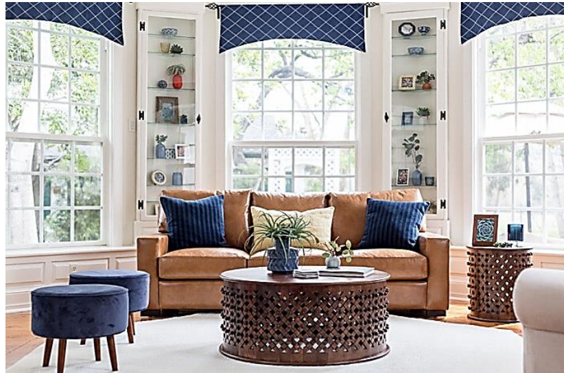
Figure 1 Photo of Interior