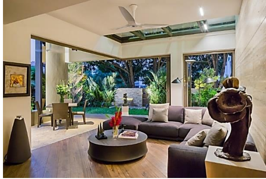
Figure 5. Interior Photo Shot on Sunset