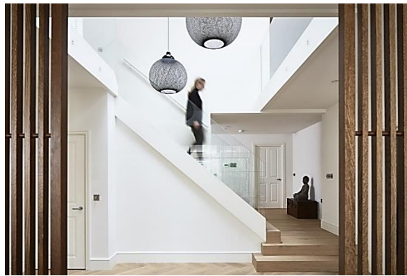
Figure 7. Use of Human Figure on Photo

According to Hyun (2016), the use of human figures in photo representations can increase the additional role that concerns the richer aspects of a building or space. where human figures can convey architectural properties and realize how architecture can be shaped to accommodate the human experience.