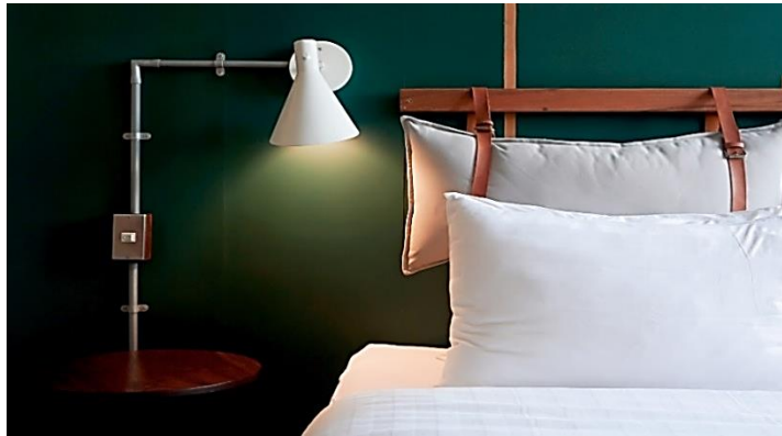
Figure 10. Rule of Third Composition (Bed Room, The House Tour Hotel)