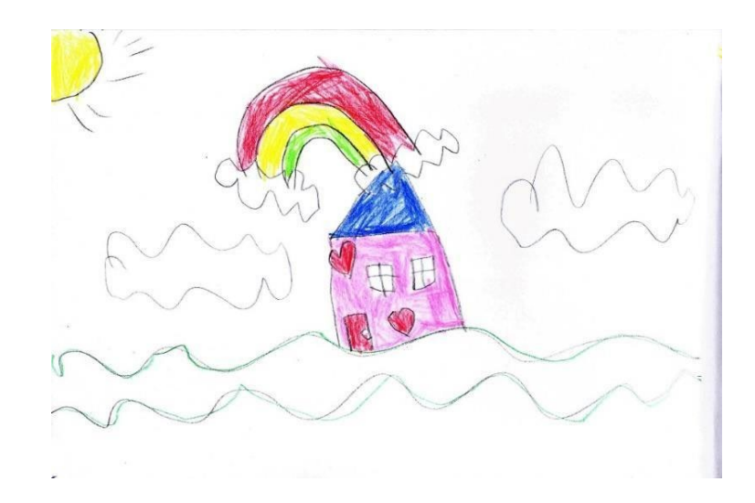
Figure 2 Children's drawing by Alika Syakila Putri-6 years old

In this research, the object studied is a child's drawing by a 6-year-old student of a kindergarten in Bandung. The object that can be seen in Figure 2 was chosen because it has elements in the form of symbols that can be studied through semiotics.