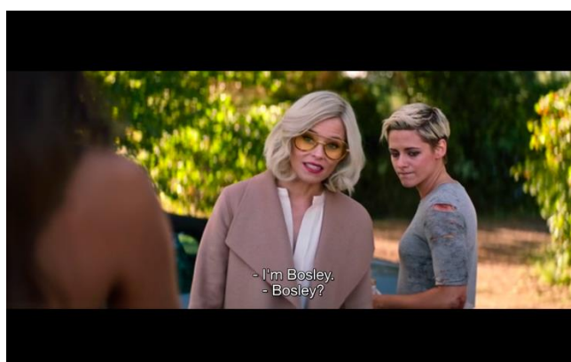
Figure: 3. The woman said, "I'm Bosley".

The ideological code contained in this scene is the ideological code of feminism. The stigma that exists in their society assumes that men's potential is better or higher than women's, Sabina shows that women also want to have the opportunity to fulfill the same potential as men regardless of gender.