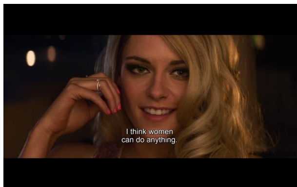
Figure: 1. Sabina said “I think women can do anything”

The film Charlie's Angel (2019) contains the issue of feminism which is taken through scenes and dialogues and is analyzed using John Fiske's semiotics method. The following are the results and data that have been collected by researchers.